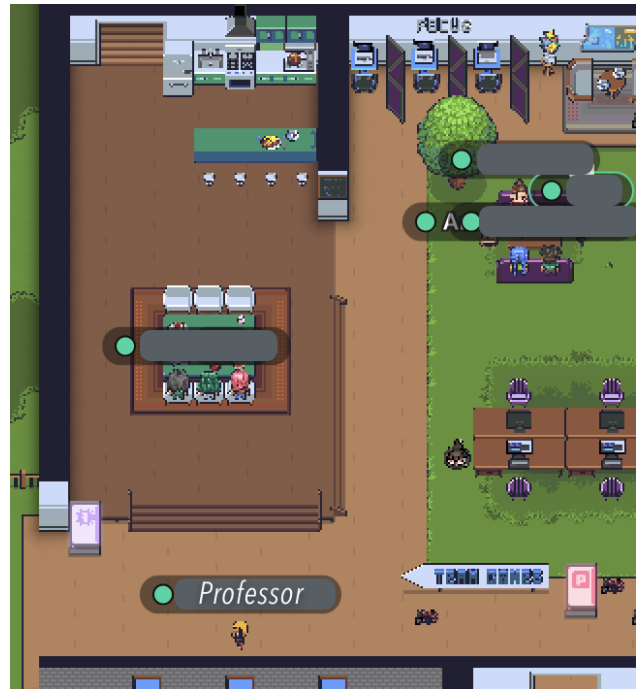
Fig. 2. Team breakout groups with Professor roaming; Team 1 sitting at a table on the deck; Team 2 sitting at a table in the top left grassy area; Team 3 in another area