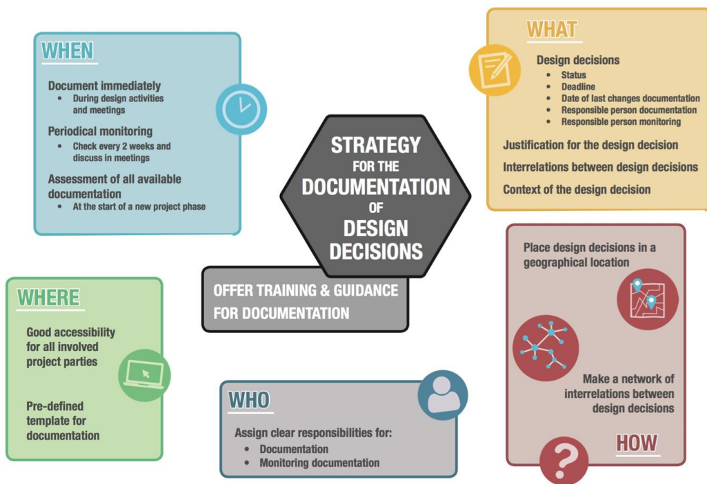
Figure 1. The concept strategy, showing all elements

The assessment of all available documentation at the start of a new project phase is addressed. This is included in the last level as findings indicate that performing this effectively could only be achieved if the assessors have a good understanding of what documentation should be available and what quality this should have. It is important that all design activities are postponed until the assessment is finished.