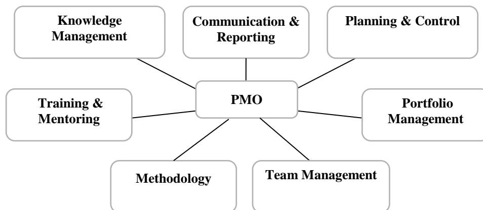
Fig. 2. Areas of PMO Services. Adapted from [16]

Thus, according to Fig. 2 and considering the state of the art contributions [2], [8], [10], [11], it is possible to identify a set of key macro-areas of PMO intervention, that are Project Portfolio Management , Knowledge Transfer and Learning , Communication Management , and Team Management :