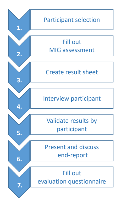
Figure 2. Case study protocol for the MIG assessment

For the application of the MIG assessment instrument, we used a case study protocol. The protocol is shown in Figure 2.